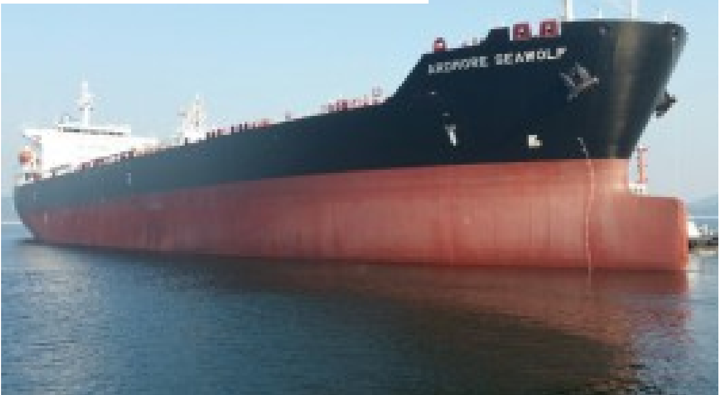
( http://splash247.com/ardmore-sells-small-chemical-pair-for-38-5m/ )