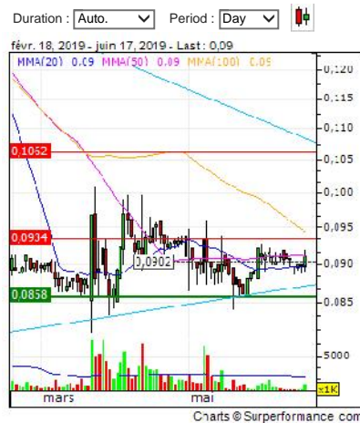
Chart D'AMICO INTERNATIONAL SHIPPING S.A.